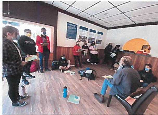
Students in the field at Terminal 117 and the Duwamish River Community Hub